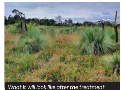
What it will look like after the treatment