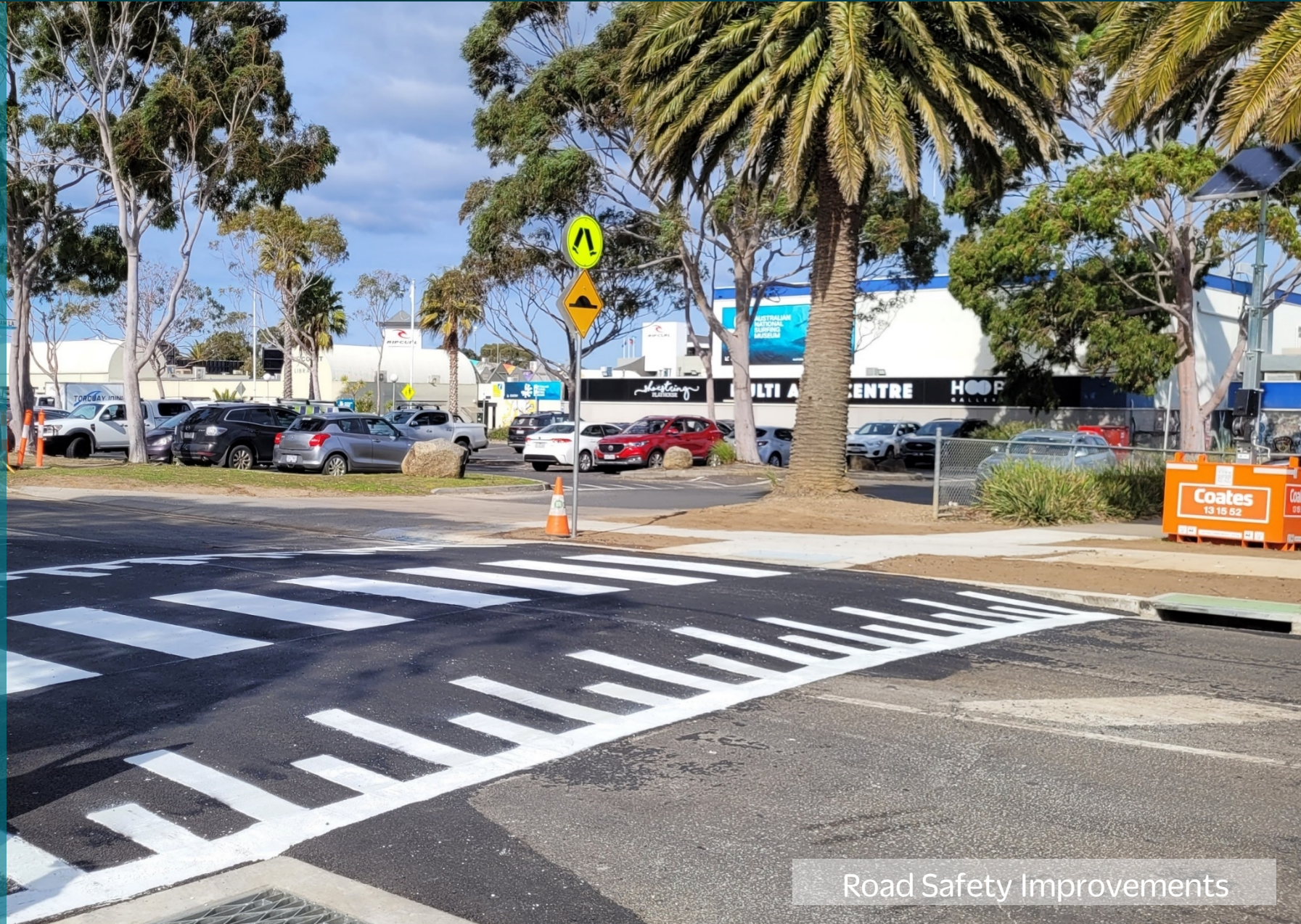
Road Safety Improvements

Council has financial capacity to deliver services now and into the future and decision making is informed by community views.