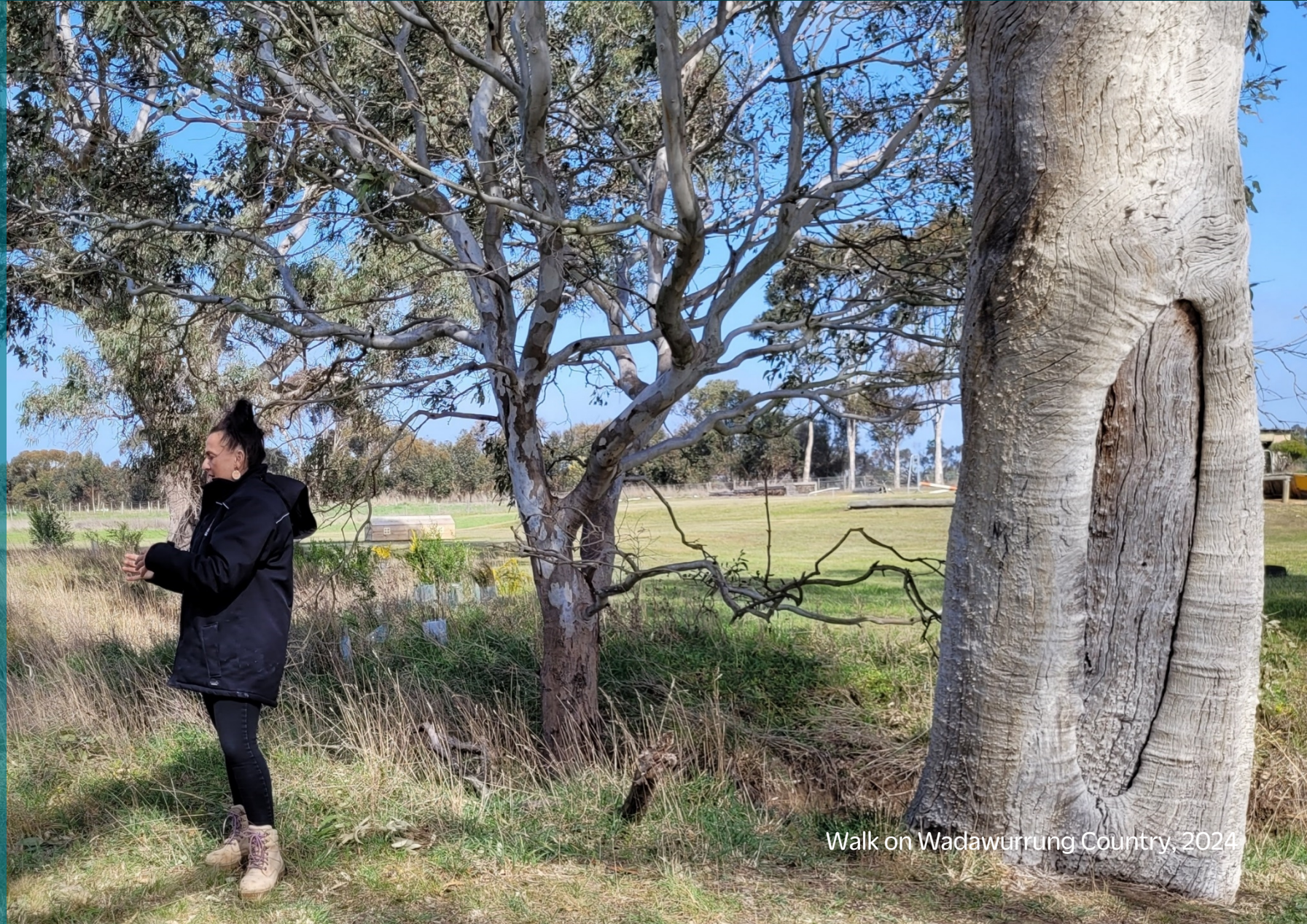
Walk on Wadawurrung Country, 2024

Reconciliation with Traditional Owners and other Aboriginal and Torres Strait Islander people in our community through respectful engagement, acknowledgement and collaboration