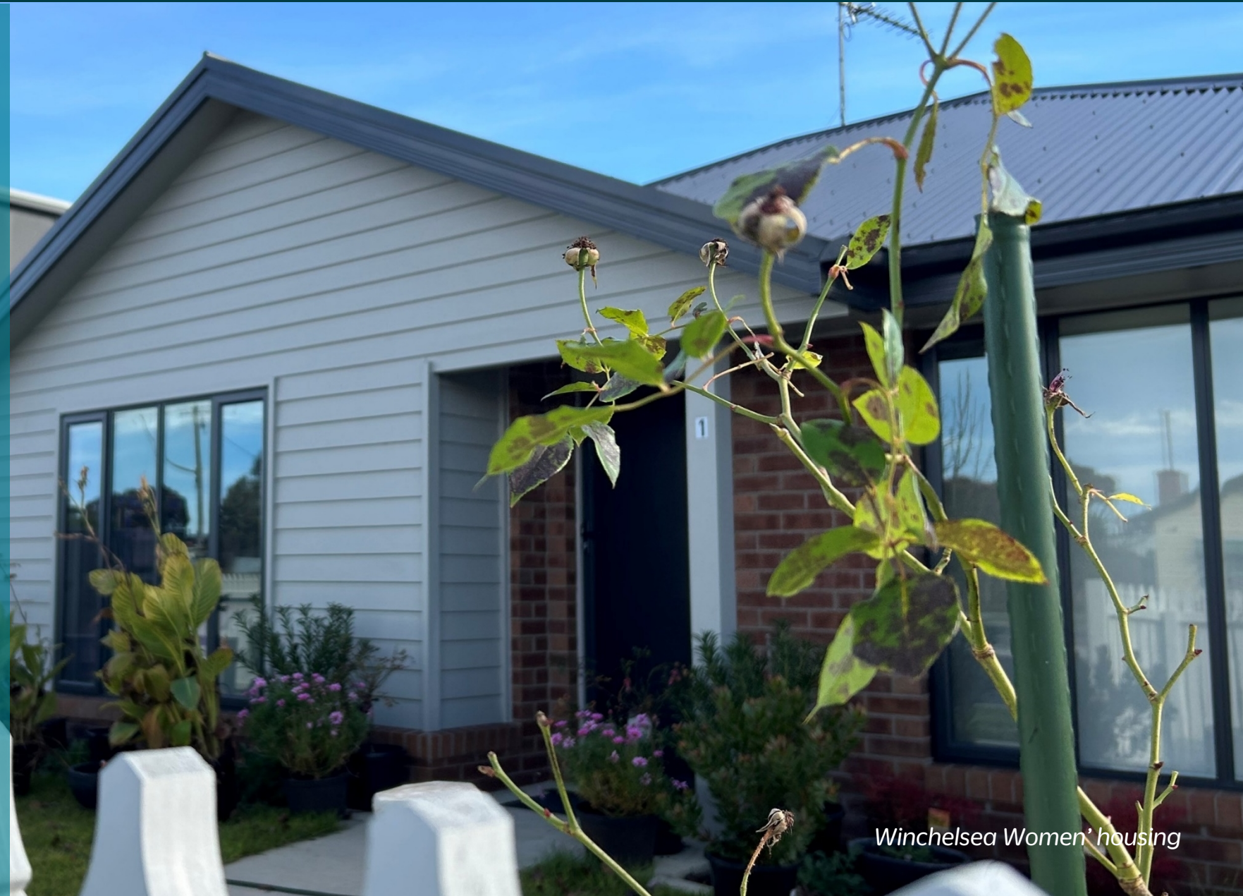
Winchelsea Women's housing

Growth is not at the expense of environmental values or the unique heritage and character of our townships