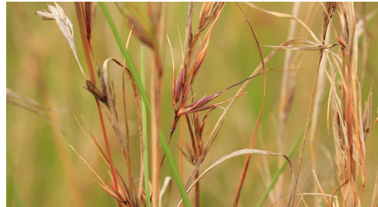
Existing Kangaroo grass (Themeda triandra)