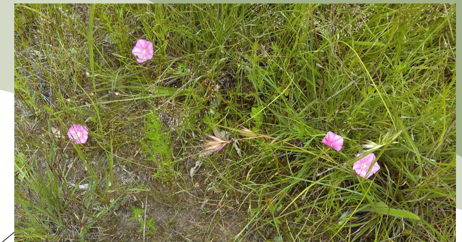
Existing Pink bindweed (Convolvulaceae)