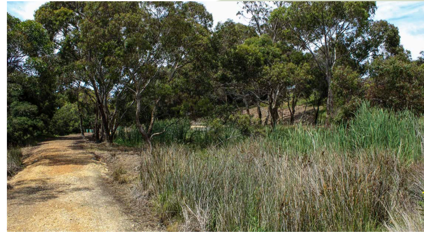
Potential design for possible walking path

Overall objective: Celebrating the unique natural values of the Winchelsea Common