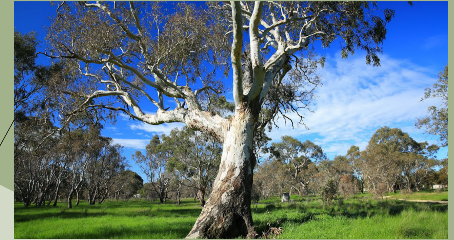
Existing River Redgums