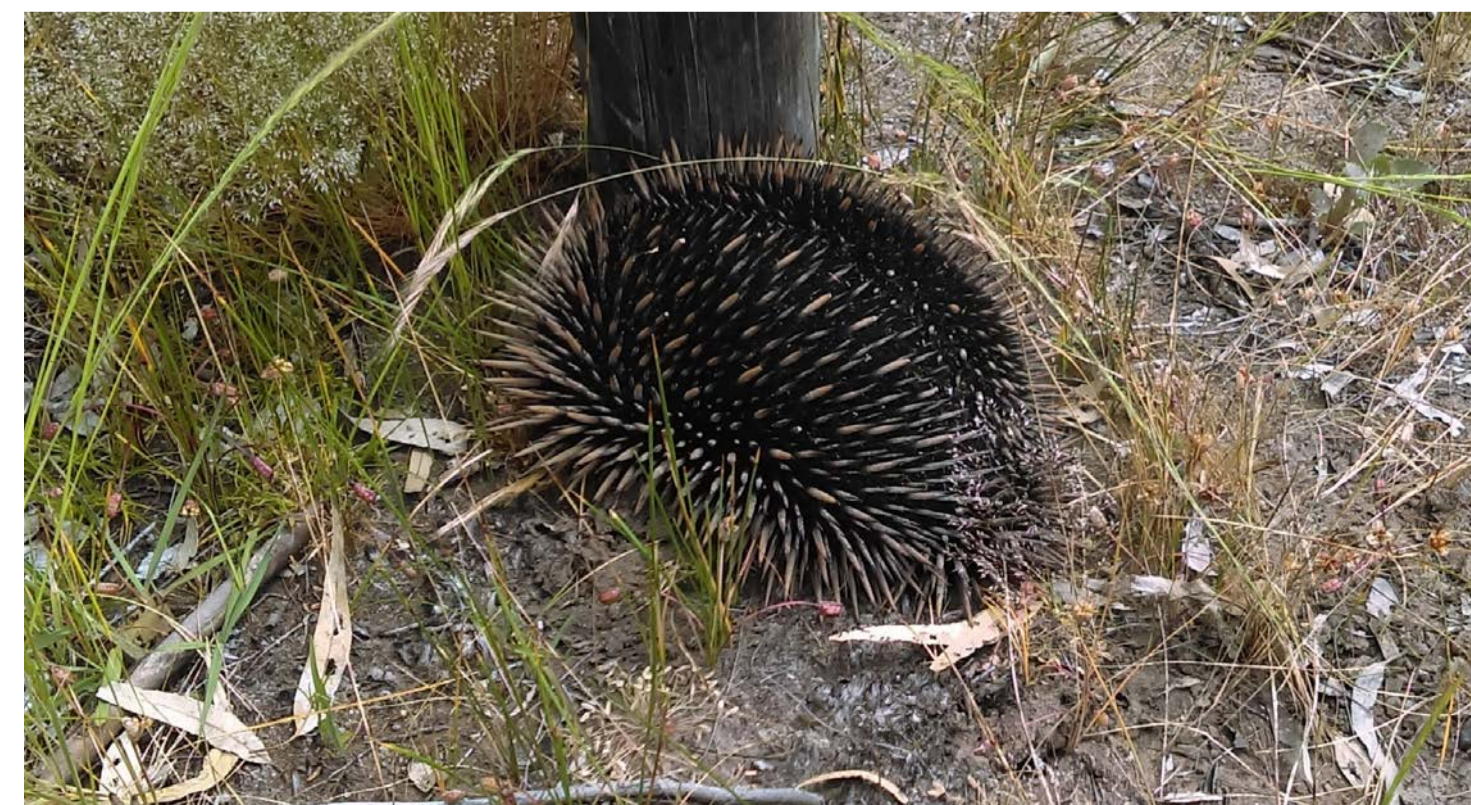
Wildlife found in the common